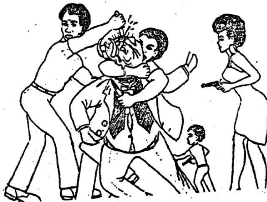
Brothers and Sisters Deal with White Store Owner that Robs Black People.